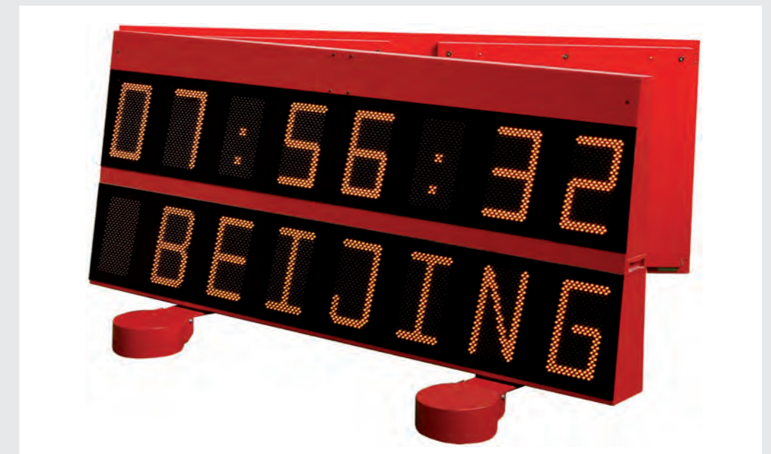
The BEST TIME display in a pair with its foldable wheels

The BEST TIME display is the ideal information panel required on the athletic field and specially at the finish line and was specially designed to fulfill those requirements. As soon as the leading or winning athlete crosses the finish line, the time is displayed and becomes immediately visible to the other athletes, the public and the medias. Its wheels allows BEST TIME to be easily installed close to the finish line or anywhere on the field, providing excellent visibility to both the athletes and the spectators. BEST TIME units can be used in pairs. The wheels can also be folded for transport. BEST TIME features two lines of eight alphanumeric characters; amber LEDs provide excellent visibility at distances of up to 150 meters. A sensor adjusts the brightness according to the ambient light conditions. BEST TIME can be linked to any timing devices such as the CHRONOS for split times or the Scan'O'Vision photo finish camera for finish times.