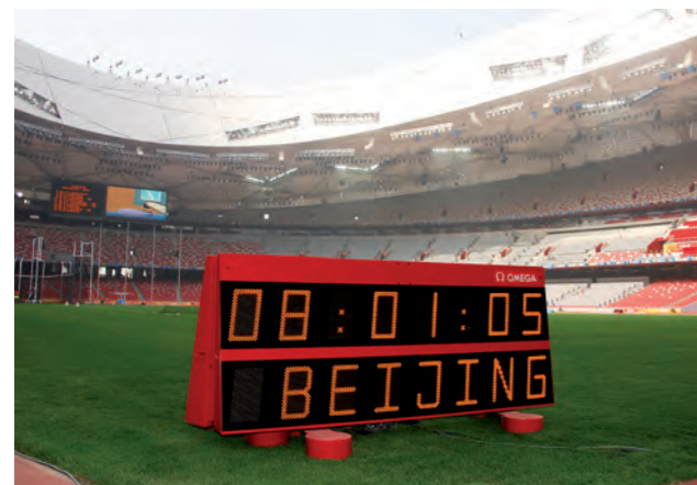
Best Time displays are spread in all 4 corners of the field offering a perfect visibility for everyone even in the biggest stadiums