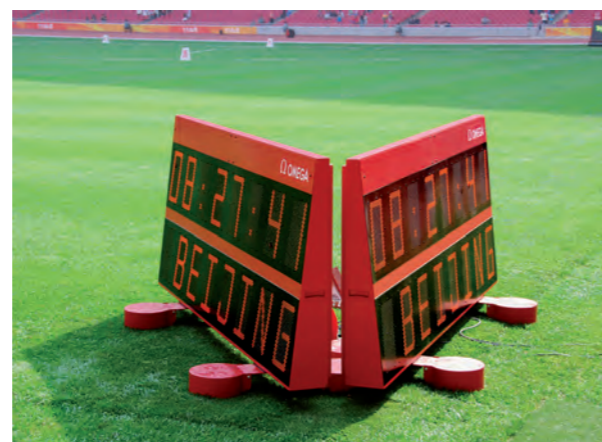
Best Time displays can be used by pairs at the finish line